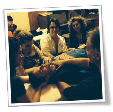
A multihands session